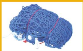
Safety net 1.75 x 1.6 x 1.6 SWL 2000 kg